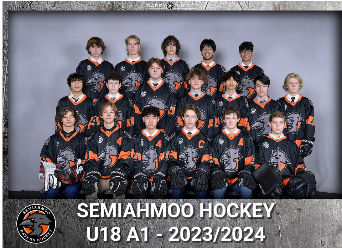
SEMIAHMOO HOCKEY U18 A1 - 2023/2024